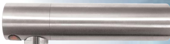
D615/F Flat /horizontal wall mounted automatic tap

Easy to install, with options for Mains or battery operated, DVS No-Touch products allow you to control your water efficiently, conserve energy and cut down on your costs without sacrificing performance and reliability.